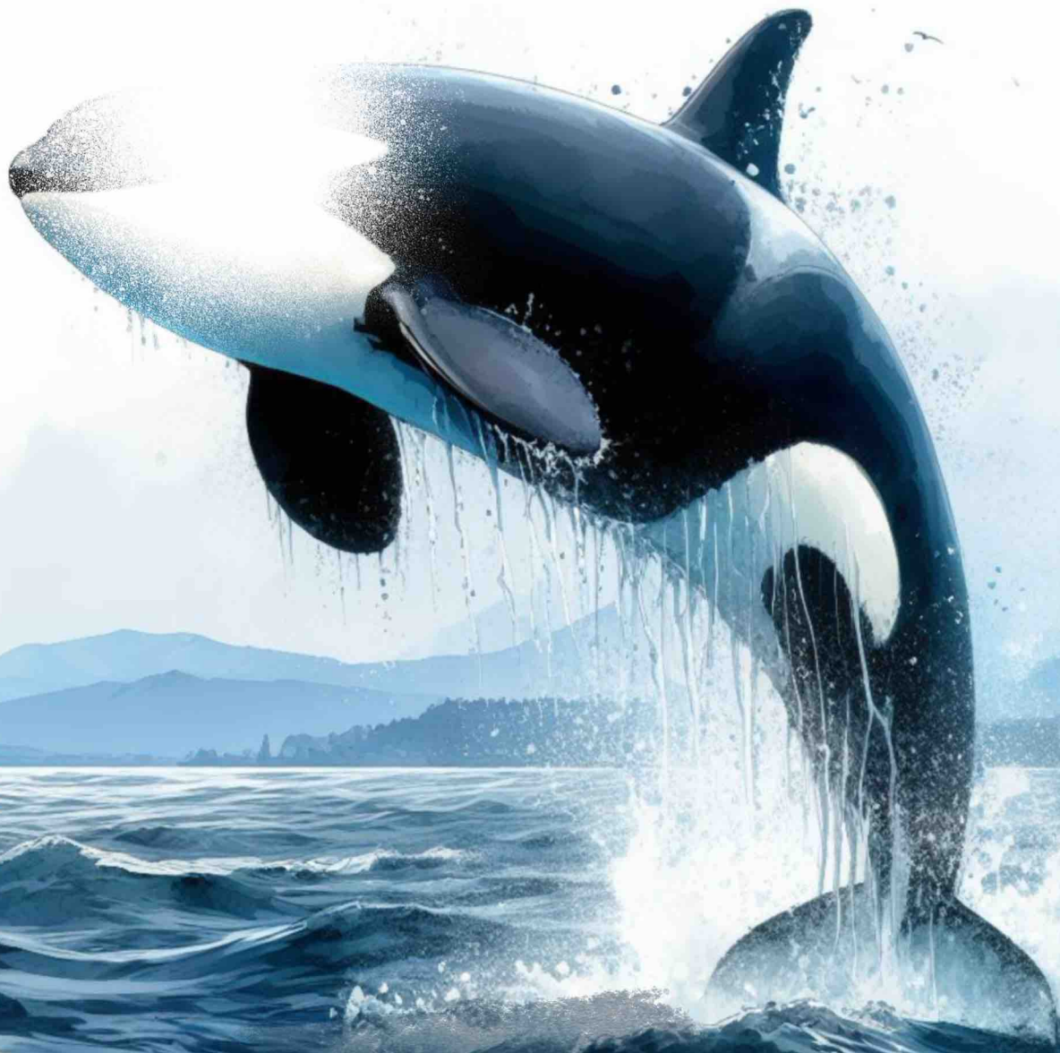
ILLUSTRATION BY NIDA (WAS CREATED WITH THE ASSISTANCE OF DALL E) ENGLISH TRANSLATION BY NANDYKA YOGMAYA